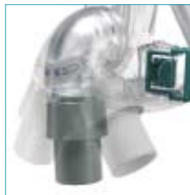
Rotating elbow—flexibility of air tube position

ResMed Corp Poway, CA, USA +1 858 746 2400 OR 1 800 424 0737 (toll free), ResMed Ltd Bella Vista, NSW, Australia, 61 (2) 8884 1000 or 1 800 658 189 (toll free). Offices in Austria, Finland, France, Germany, Hong Kong, Japan, Malaysia, Netherlands, New Zealand, Singapore, Spain, Sweden, Switzerland, United Kingdom (see website for details). Protected by patents: AU 710733, AU 741003, AU 766623, AU 772832, AU 775051, AU 777033, CA 2261790, DE 29724224, EP 0956069, NZ 513052, NZ 526165, US 6112746, US 6357441, US 6374826, US 6412487, US 6439230, US 6463931, US 6532961, US 6557556, US 6581602, US 6634358, US 6691707, US 6796308. Other patents pending. Protected by design registrations: AU 139764, DE 49911833, DE 40301991, FR 997839, FR 031425, JP 1117921, JP 1197930, US D443355, US D486227, US D493522. Others pending. AutoSet, Ultra Mirage, and Mirage are trademarks of ResMed Ltd. ©2005 ResMed Ltd. 1010456/1 05 02