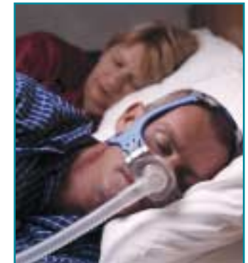
Comfortable yet stable—a great night's sleep for everyone