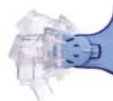
Fit Angle Selector

Mirage Vista is designed with easy-lock parts and more preassembled parts. Even if your vision is no longer 20/20, or if your fingers aren't quite as nimble as you may want them to be, you will find the Mirage Vista easier to put on, take off, clean, and handle than other masks.