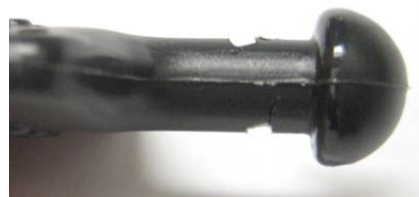
Wear Test Picture

Below is another picture of the shaft that shows the result of one of our validation tests. This test estimated nearly 8 years of usage with the socket area in the EXACT same location on the shaft of the ball clip, as evidenced by the deep groove. Even this worst case scenario was not enough to break the shaft: