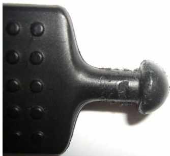
Normal Usage Picture

Here is a picture of the shaft area that shows normal wearing after normal usage: