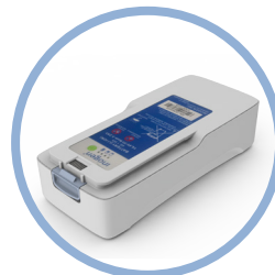
Inogen One ® G4 Extended Life Lithium Ion Battery** Up to 5 hours run time Item #BA-408