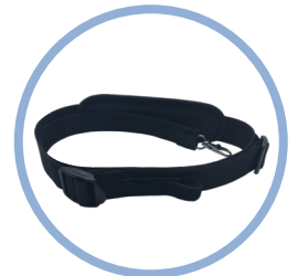
Inogen One ® G4 Carry Strap* Item # CA-401