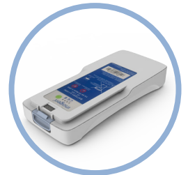
Inogen One ® G4 Lithium Ion Battery* Up to 2.7 hours run time Item #BA-400