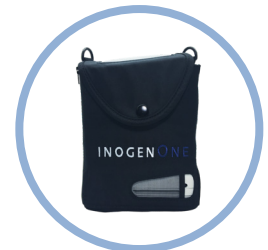
Inogen One ® G4 Carry Bag* Item # CA-400