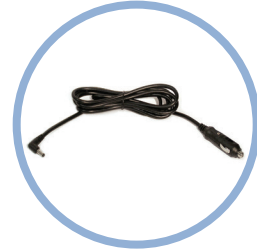
Inogen One ® G4 DC Power Cable* Item # BA-306