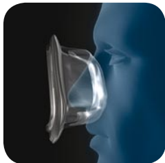
... and contracts