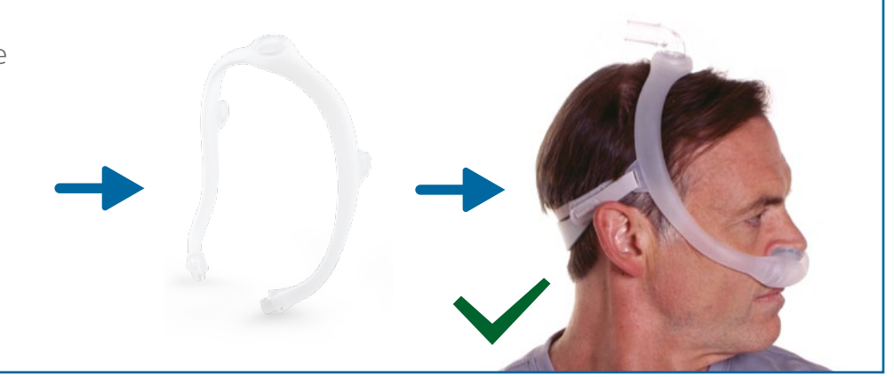
Medium correct frame

The medium mask frame will comfortably fit most faces. If the medium frame does not fit a patient's face, a small or large mask frame might better suit your patient's needs.