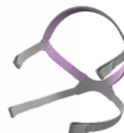
AirFit N10 for Her headgear 63261 (Sml)