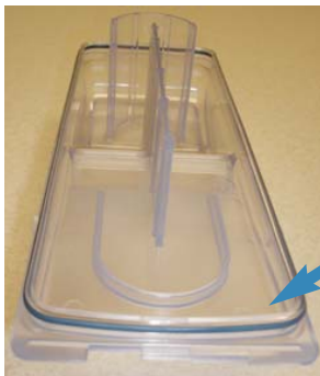
BLUE MIDDLE SEAL