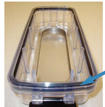
BLACK MIDDLE SEAL