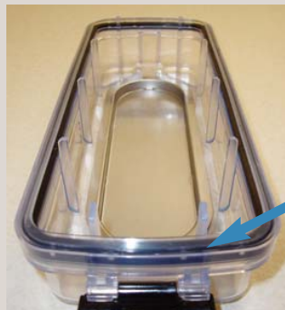
BLACK MIDDLE SEAL