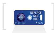
Timestrip® - 6 Month Reminder