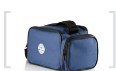
Deluxe Carrying Case