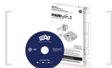
Trek® S Instructions & Instructional DVD