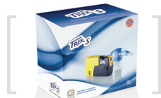
Trek® S Premium Packaging

All configurations include Wing Tip™ Tubing