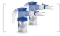
PARI LC® Sprint Reusable Nebulizer and backup reusable nebulizer