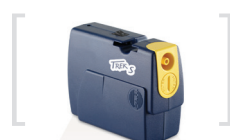
Trek® S Compressor

Trek® S vs. Other Portable Nebulizer Systems²