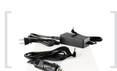
AC Adapter & 12V DC Adapter