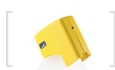
Li-Ion Rechargeable Battery Deluxe Only