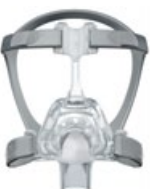
62118 Mirage FX Wide