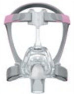
62128 Mirage FX for Her