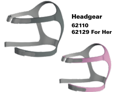
Headgear 62110 62129 For Her