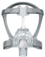
62103 Mirage FX