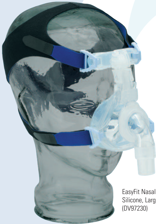
EasyFit Nasal Mask Silicone, Large (DV97230)

The ball-and-socket joint at the tubing connector accommodates even the most active sleeper and contributes to the mask's overall comfort. The unique whisper-quiet EasyFit exhalation system is designed in such a way that neither the patient nor sleeping partner is disturbed by the flow of exhaled air.