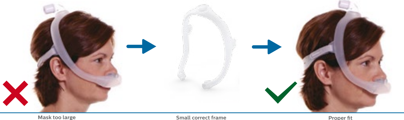
Mask too large