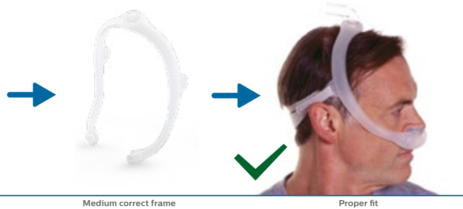
Medium correct frame

The medium mask frame will comfortably fit most faces. If the medium frame does not fit a patient's face, a small or large mask frame might better suit your patient's needs.