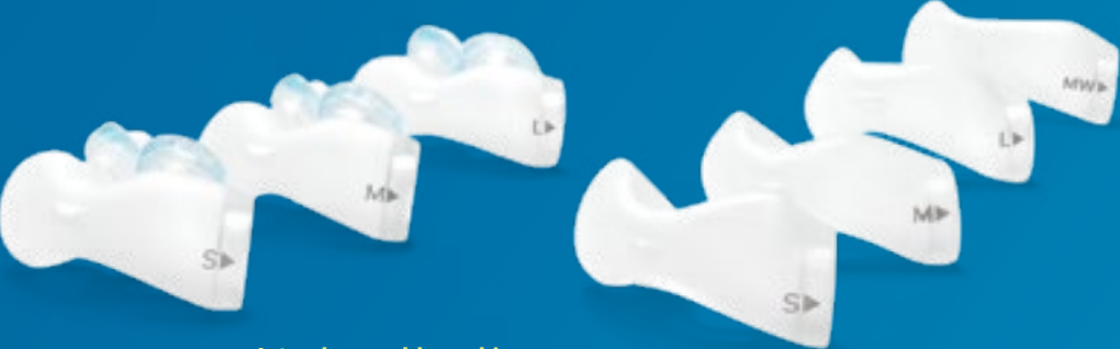
Interchangeable cushions Easily switch between nasal and gel pillows cushions.