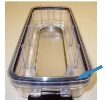
BLACK MIDDLE SEAL