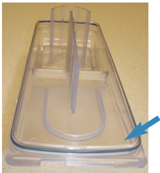
BLUE MIDDLE SEAL